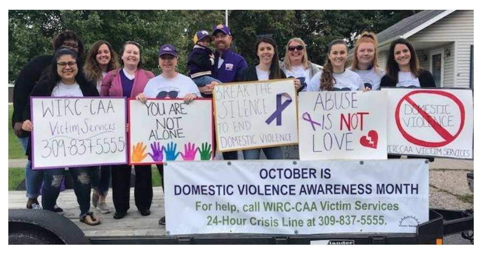
Victim Services counselors and volunteers hold signs speaking out against domestic violence during the Western Illinois University Homecoming Parade on October 5, 2019.

Staff members of WIRC-CAAVictim Services and volunteers participated in the WIU Homecoming Parade on Saturday, October 5, as part of their outreach campaign for Domestic Violence Awareness Month. Victim Services seized the opportunity to join the parade as a way to connect with residents of Macomb and students of Western Illinois University. Staffers displayed signs encouraging the public to speak out against domestic violence, as well as signs listing ways for survivors to call for help. Victim Services counselors and advocates