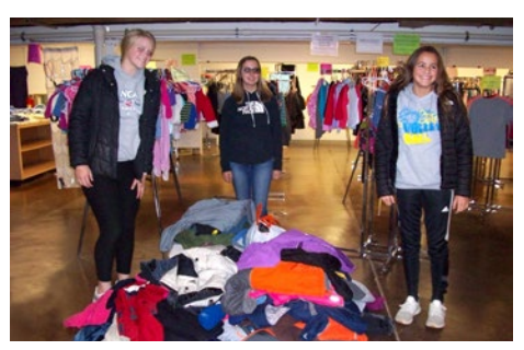
The Scotland Clever Clovers 4-H Club held a coat drive for WIRC-CAA's Clothing Center.

Domestic and sexual violence can happen to anyone of any age, ability, sexual orientation, income, education level, religion, gender identity, or ethnic background.