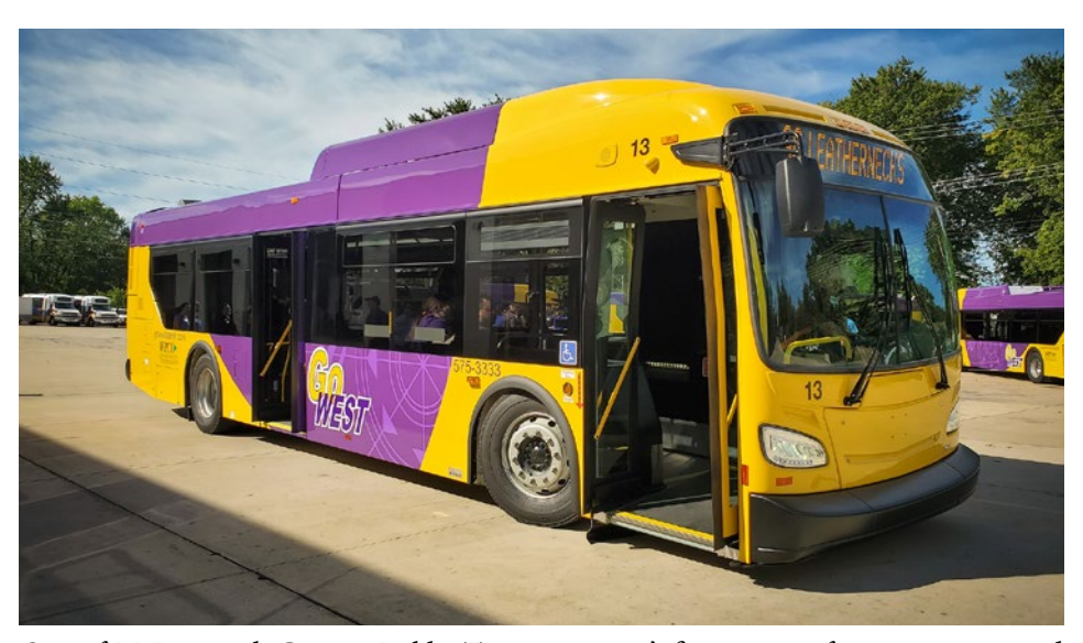
One of McDonough County Public Transportation's five new 35-foot, 24,000-pound New Flyer Excelsior Clean Diesel buses is displayed at a media event on September 13, 2019.

McDonough County Public Transportation (MCPT), owned by the City of Macomb, celebrated the addition of five new buses to the Go West Transit fleet on September 13. A ribbon cutting ceremony was held courtesy of the Ambassador Committee of the Macomb Area Chamber of Commerce. The five new 35-foot, 24,000-pound New Flyer Excelsior Clean Diesel buses, manufactured in Anniston, Alabama, replaced high-mileage aging buses that were in service for more than 20 years. With the purchase of these five new buses, the average age of the Go West fleet was reduced from 16 years to 10 years.