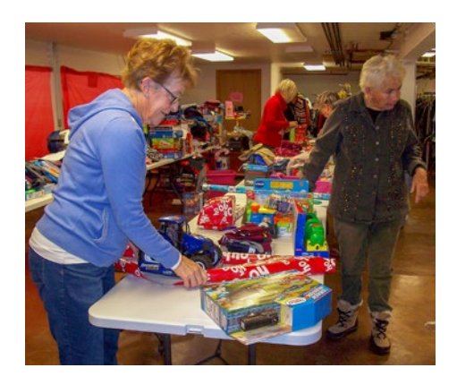
Project Santa "elves" wrap gifts for children in need at WIRC-CAA's Project Santa Headquarters.

For over 35 years, WIRC-CAA's Project Santa Program has provided children in need in Hancock, Henderson, McDonough, and Warren counties with a happy holiday full of gifts, food, and clothing. Each child accepted into the program receives approximately $75 worth of toys and clothing, and their family is provided with a holiday meal to take home. On designated days in December, each child has the opportunity to meet Santa Claus and open one gift with him. The remaining gifts are sent home with the family to open on Christmas Day.