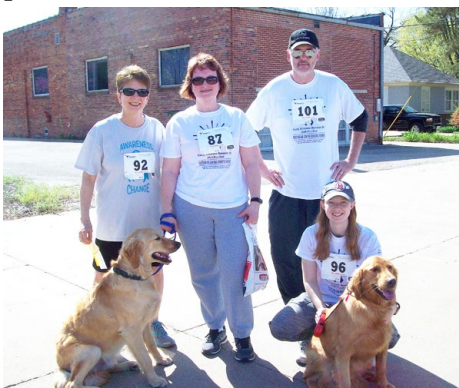
Dogs on a leash are welcome to attend the Simmons 5K.

Victim Services provides free and confidential services in a safe environment with knowledgeable staff members who are ready to provide emergency services, advocacy, counseling, professional training, and public education. All services are provided free-of-charge to survivors of domestic and/or sexual violence. For more information, visit wirpc.org/simmons/ , find "WIRC-CAA Victim Services" on social media, or call (309) 837-6622. If you or someone you know are being abused, call their 24-hour free and confidential crisis hotline at (309) 837-5555.☎