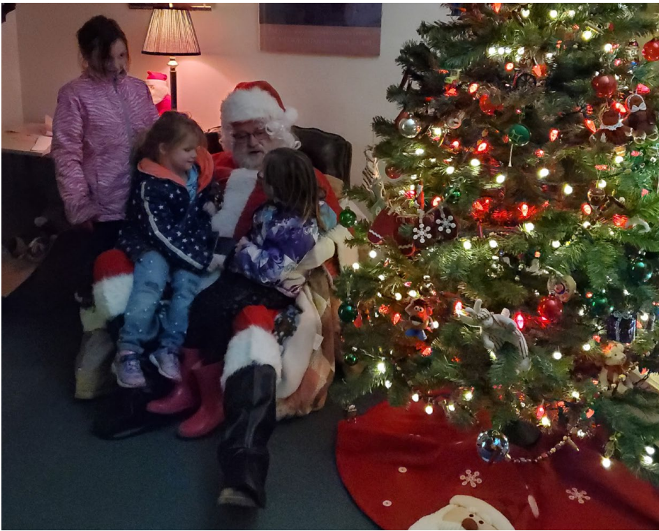
Santa Claus asks Project Santa children what gifts they are hoping to receive for Christmas. Project Santa provides a happy holiday full of gifts, food, and clothing to children in need in Hancock, Henderson, McDonough, and Warren counties.

This was another busy year for our Project Santa (PS) Program! The PS program and its small staff and band of merry elves and volunteers provided a happier holiday season to 121 families and a total of 313 children in the four Community Action Agency counties of Hancock, Henderson, McDonough, and Warren.