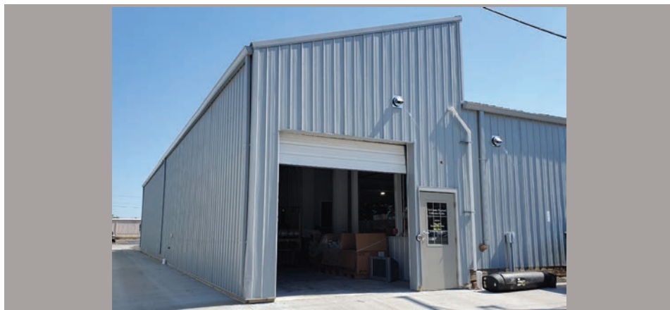
Thousands of pounds of e-waste and household paint are processed for recycling every year at Tri-County Regional Collection Facility in Macomb.

Tri-County Regional Collection Facility provides paint and electronics recycling services in Mercer, McDonough, and Warren counties in western Illinois. For many years, the facility has been located on Pearl Street in Macomb. As of June 16, 2020, the facility moved their base of operations to 129 West Jackson Street near the Macomb Downtown Square.