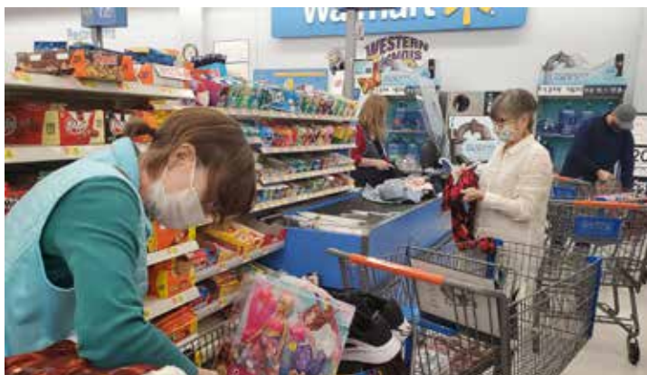
During the pandemic, Project Santa "elves" practiced social distancing to shop safely for thousands of items on children's wish lists