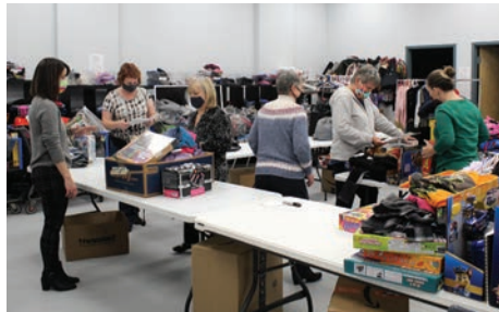
Volunteer elves sorted thousands of gifts, including toys and clothing, for over 500 children enrolled in the WIRC-CAA Project Santa program.

“The children enrolled in this program often need things that many people take for granted, like their own blanket or comforter, shoes that fit, winter coats, or